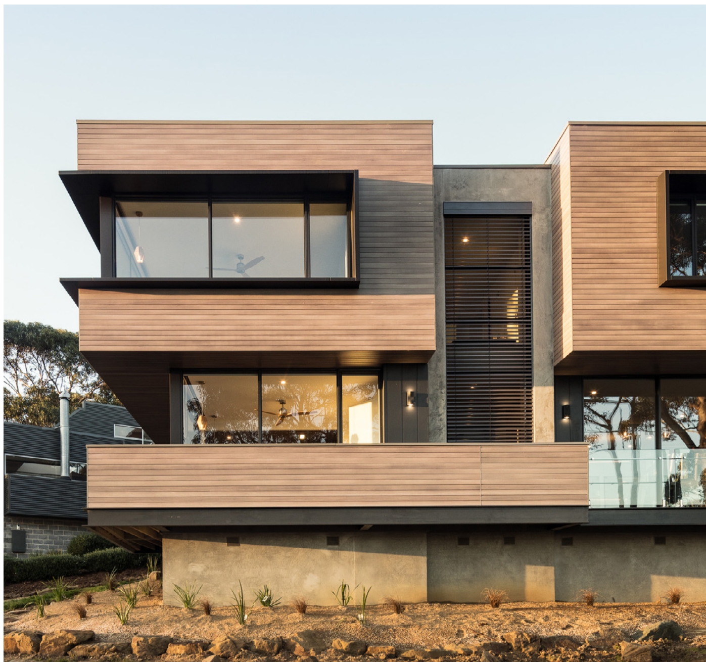
Above: DecoClad aluminium cladding on a modern home.

In this whitepaper, we take a closer look at cladding systems and explore how smart specification choices can affect costs. We examine economic, environmental and aesthetic costs, highlighting the importance of a broad definition of cost when evaluating cladding solutions.