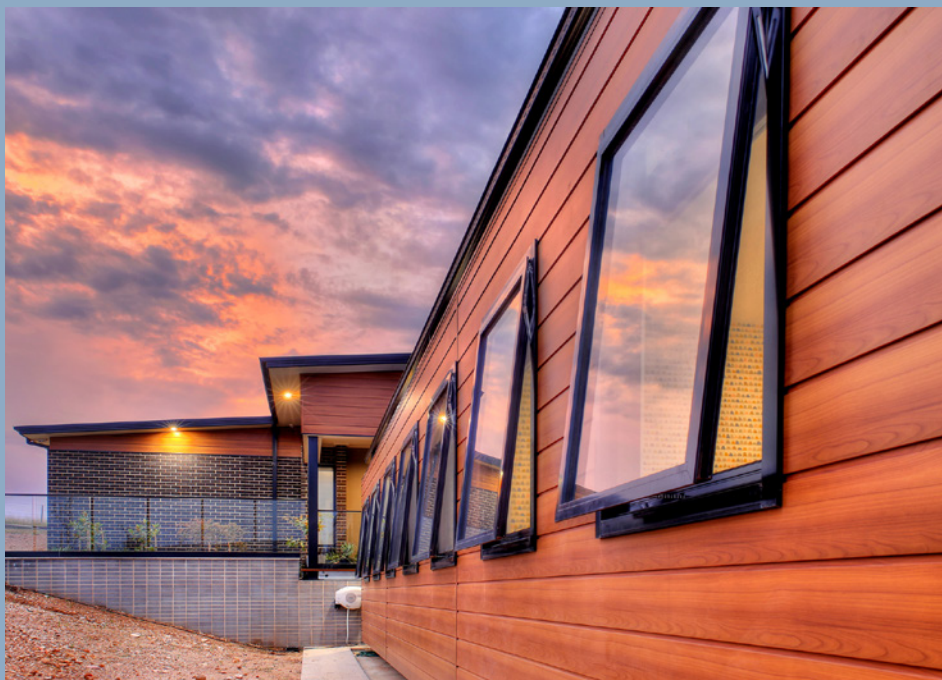
Left: DecoClad aluminium cladding.