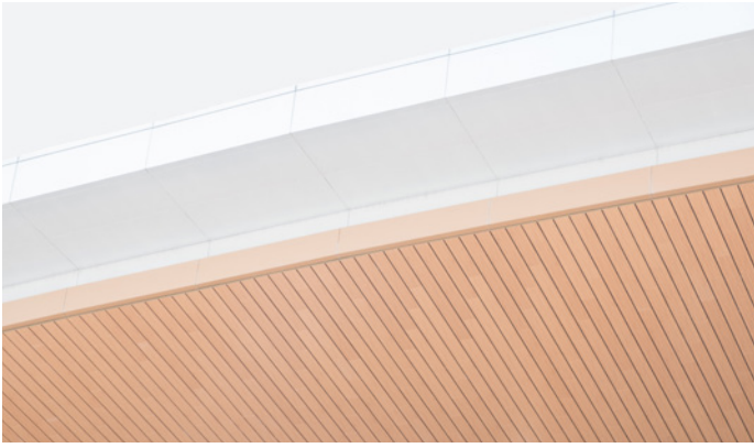
Left: Standard Timber Cladding installed as a ceiling feature.